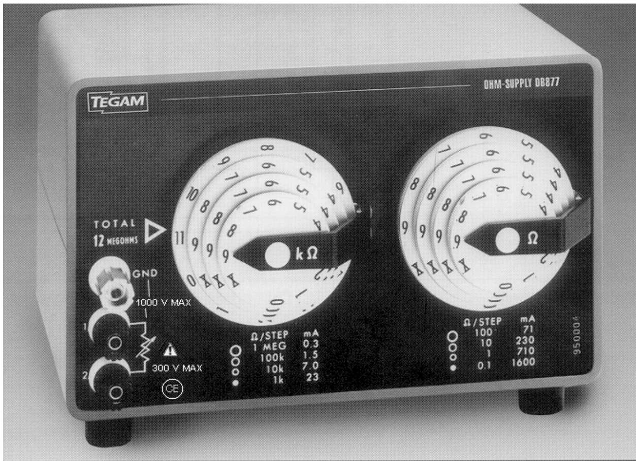
Figure 1 Model DB877

Accuracy over a wide range of ambient conditions is assured by the use of resistors exhibiting low temperature and power coefficients. A single continuous filament winding on a thin mica card is used wherever possible. For high-resistance values, a non-inductive winding on a ceramic bobbin is used. Switches with multiple contacts of solid silver-alloy provide low, stable contact resistance.